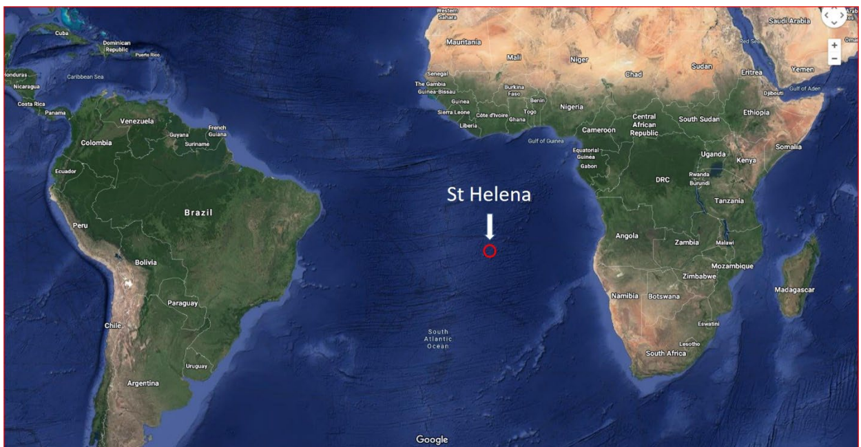
Figure 1: Location of St Helena on world map (source Google maps)

Besides collecting data, part of this project also involved various outreach activities from school visits to public talks, interviews with recreational and commercial fishermen and working closely with local stake holders.